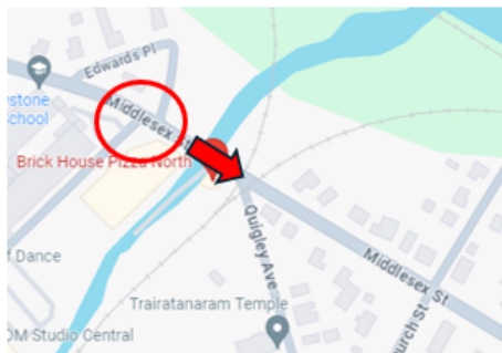
Direction of Flushing: Middlesex St.

Yellow Layer: Properties which may experience discoloration (may reach Vinal Sq.)