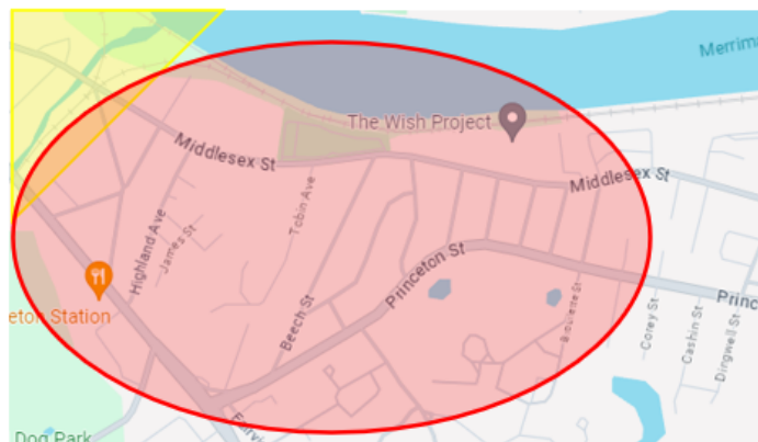
Estimated Affected Area